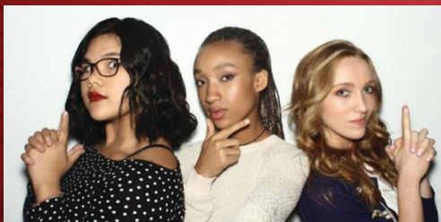
Entertainment GET LIT