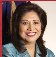
Special Guest SUPERVISOR, HILDA L. SOLIS Los Angeles County, First District